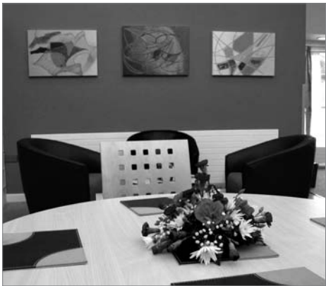
EHE project, South Staffordshire Health Care NHS Foundation Trust.

More recently, the King’s Fund released a Combined Model that uses a wider range